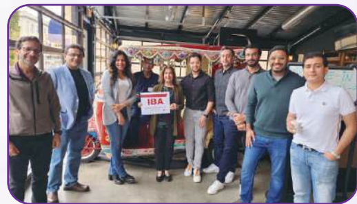
IBA Alumni US Chapter November 2022

IBA and Ebrahim Ali Bhai Foundation partnered to grant partial financial aid to the students of IBA. This year, the Foundation solidified its commitment by agreeing to sponsor another 50 students, in addition to the 50 students from the previous academic cycle. This direct support has become a lifeline for students, easing their financial pressures and propelling them forward in their academic pursuits.