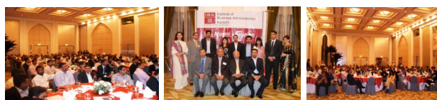
UAE Chapter Launch in July 2010