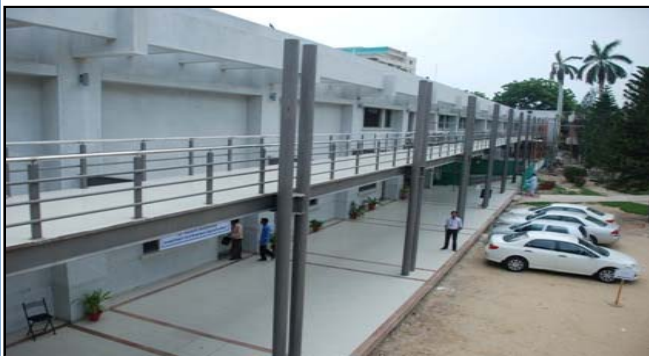
Block, Main Campus

Boys' Hostel, Academic Block (both campuses), Auditorium at the Main Campus, and the Canteen at the City Campus have been successfully completed.